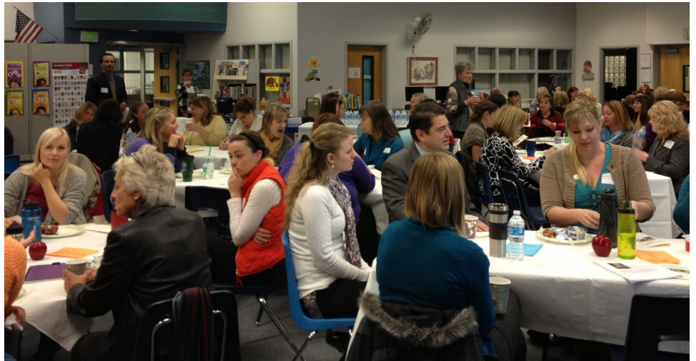
A kick off breakfast, attended by Putnam staff, community early care and education programs, school board members and state staff and legislators, was held in fall 2012 to bring everyone together in the effort to support school readiness.

ECCLC received a three year grant to support the quality care and education of young children in programs who may attend Putnam Elementary School. Putnam is a Title 1 school serving a large number of at risk children as defined by a variety of measures including limited income, homelessness and low academic performance of students. The intent of the grant is to support young children earlier in life and increase their ability to be successful in school and beyond. Six early care and education programs are involved in this work. Program quality is measured annually through the state's current quality rating and improvement system, Qualistar. Mini grants are provided to assure children have access to developmentally appropriate materials. Teachers are able to access scholarships and other professional development opportunities. Critical to the success of the project is a connection being made between Putnam Elementary staff and staff at the community early care and education programs to learn more about each other, the various roles each has with children and families, and better support the transition between pre-school and kindergarten.